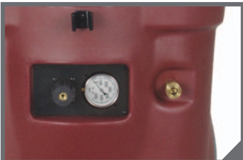
Externally adjustable pressure gauge.