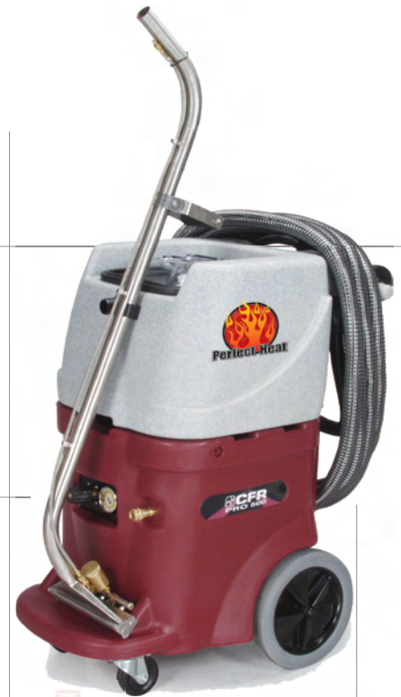
PRO-500 with PerfectHeat™